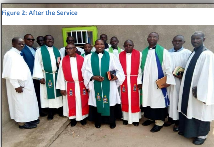
Figure 2: After the Service