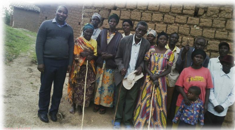
Figure 3: The Archdeacon and some of Bushenyi Chapel members

The Pastor, church choir members, catechists, and mission outreach teams of Butansinda Parish have made evangelization visits to families, chapels, grass-root churches neighboring parishes; schools; etc.