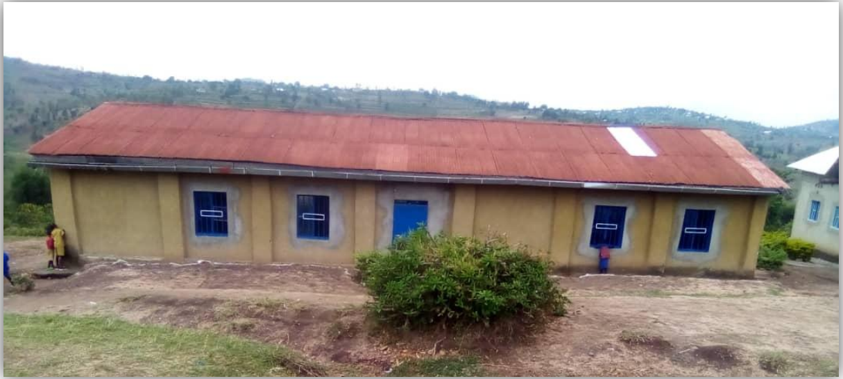
Figure 5: Church Building

Nyagisozi parish is one of the parishes of the Anglican Church of Rwanda, Shyogwe Diocese, Hanika Archdeaconry. It has been created in 1985 and stated with the following chapels: Nyagisozi, Gahombo, Musenyi, Kareba, Kidaturwa, Nyarurama, Cyeru, Nyabitare, and Ntongwe. The parish gave birth to two parishes which are Gahombo and Cyeru. Also, the parish conceded one chapel (Nyarurama) to Cyimana Parish. To date, twelve (12) pastors have been priests of Nyagisozi parish. The parish has 1 school, 5 chapels (Nyagisozi, Ntongwe, Kareba, Kidaturwa and Ruko). In the following pages we will relate the main activities accomplished in the year 2019.