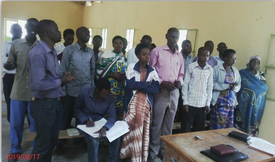
Figure 4: Members of the Parish Leading Committee before their meeting

Different meetings were organized at the chapel and parish level.